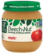
Beech-Nut 2nd Foods (4 oz. jar)

desserts, dinners, cobblers, delights, custards, yogurts, medleys, Beech-Nut Naturals, added DHA/ARA, or added sugar, starch, or salt