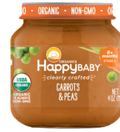
Happy Baby 2nd Foods (4 oz. jar)