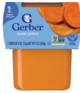
Gerber 2nd Foods (2 pack)