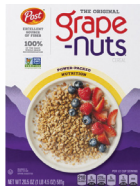
Grape-Nuts The Original