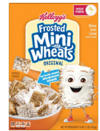
Frosted Mini-Wheats Original