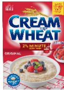
Cream of Wheat Original 2½ Minute