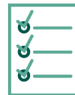
WIC Items Shopping List