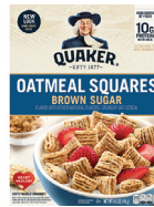
Oatmeal Squares Brown Sugar