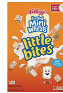
Frosted Mini-Wheats Little Bites