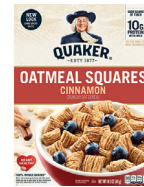
Oatmeal Squares Cinnamon