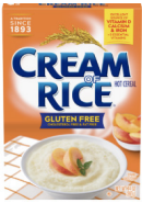
Cream of Rice (regular)