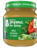
Gerber Organic 2nd Foods (4 oz. jar)