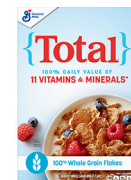
Total Whole Grain