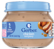
Gerber 2nd Foods