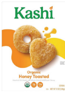
Organic Honey Toasted