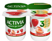
Activia (four pack 4 oz. cups)